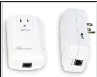
#4827 BoosterLinc™ Plug-In Amplifier

SignalLinc Repeater is ideal for improving the home automation signal strength throughout all the outlets in a home. But, as the PLC signals travel down a circuit and away from the repeater, it will weaken by the same factors listed above. Additionally, the signal will get weaker as it passes installed PLC transmitters. Each PLC transmitter contains a tuned circuit that when it's not sending signals it's absorbing them! In addition to plug-in transmitters, LampLinc™ 2-Ways, SwitchLinc™ 2-Ways, ToggleLinc™ 2-Ways, ApplianceLinc™ 2-Ways,