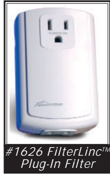
#1626 FilterLinc™ Plug-In Filter

Testing for the problem is simple. If a device is suspected of causing signal absorption, unplug the device and then re-transmit the signal. It is very important that the device is unplugged and not just turned off! If the controlled product begins working after the appliance is unplugged, then a filter will be needed on that device to keep PLC signals from being absorbed and raise the signal strength of the entire home. Smarthome has many filters that will fix the problem. An average home will need between three and five filters. If you are in the business of installing automation systems and not in the 'call-back' business, include some of these in your bid as part of the standard package.