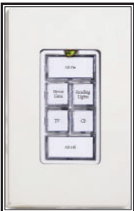
KeypadLinc 6 with 450W integrated dimmer

Unlike most electric items, many PLC-based products haven't changed much over the years.