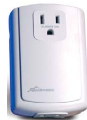
FilterLinc Plug-In Filter #1626

For HELP , call our friendly tech support @ 800-762-7846